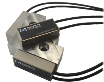
os7500 accelerometer on a 3 axis mounting block

Shown is the actual peak acceleration that can be measured on the os7510 (left) and os7520 (right) as a function of the frequency of the applied acceleration when measured with a HYPERION si155/255 instrument operating with a 1 kHz and 5 kHz scan rate.